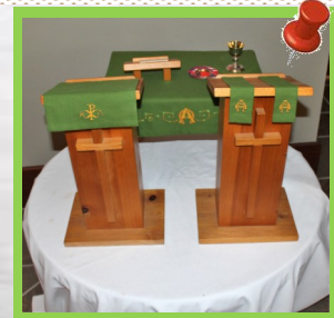
Godly Play Children's Chapel Furniture

St. Mark's has been blessed with generous donations given by two other non-profit organizations. St. Christopher's Episcopal Church in Houston donated many boxes of Godly Play materials that will be used in our educational program for children three to eight years-of-age. The donated materials included a pulpit as well as other furniture needed for a children's chapel. The Juvenile Diabetics Research Foundation donated office furniture to St. Mark's, including desks, a table, and filing cabinets, and even had the furniture delivered. We offer heartfelt thanks to these organizations for their kind support of our mission.